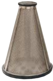
Self-cleaning, conical strainer filter is made of stainless steel.