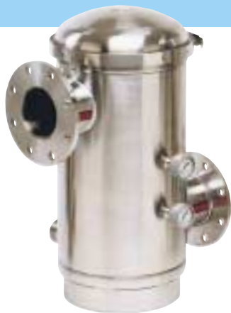
SF Series filters come standard with two pressure gauges.

All SF Series filters come with a stainless steel housing and conical shaped stainless steel filter screen. The unique filter screen is designed for up to 200 mesh filtration, filtering a flow rate of 100 to 2000 gpm with less than one psi pressure drop.