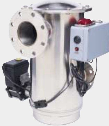
SF Series filter shown with optional pressure differential alarm and automatic flush timer.

Optional package electronically monitors pressure and purges reservoir.