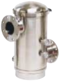
Water enters filter through inlet pipe; settled debris clears through flush port.