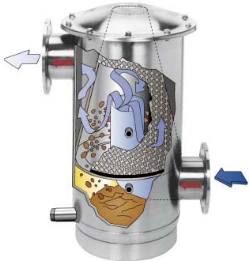
Fluid enters filter at bottom and flows through self-cleaning, conical filter as shown here.