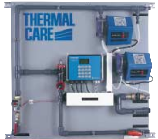
Single point monitoring and control of corrosion inhibitor, biocide, and bleed-off.