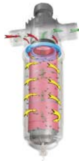
Reliable TD Series filters provide 150 mesh full flow filtration. Flow rates up to 200 gpm.